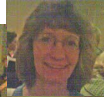
Deb checks out the exhibits.