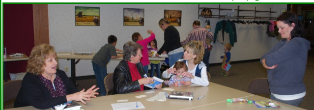
Visiting at the Gillette Family Gathering

Park Drive. It was originally advertised as the 12th, but changed to the 15th due to events beyond our control. Please RSVP at 307-782-3276 to let us know how many to expect. Come join us for a great time. Read about the gathering in Evanston and Cheyenne in our Summer Newsletter.