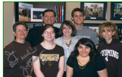
The Academic Bowl Team with Senator Barrasso.

Tuesday, March 8, was tour day for the team. After breakfasting, the team boarded a hotel shuttle bus to the nearest Metro station and experienced riding the subway to a stop near the U.S. Capitol. They met and had photos taken with Wyoming's U.S. Senator John Barrasso who then gave them tour passes for the U.S. Capitol. During the tour, they took snap-shots, gazed at, and touched statues, floorings, furnishing, and walls encapsulating the very history of our nation. After the Capitol tour, the team walked to Union Station to eat lunch, using meal tickets provided by Gallaudet University. After lunch, the team walked to the National Mall to visit the Smithsonian Art Gallery Museum. Here they saw several original paintings and works by artists that were referenced to during their competition matches! Foot weary, the team again walked back to Union Station and found the subway back to Gallaudet University for dinner, viewing the Championship Play-offs, and the Awards Ceremony. A final late night trek across Gallaudet University's campus was to KC Hotel and the concluding Social and Farewell