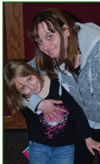
Fun in Gillette!

The Evanston Family Gathering was held at the Bear Community